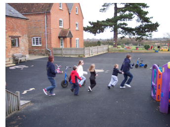
Our conga line in full flow!

Thomley kept up its Christmas traditions in 2008 with a visit from our beloved Santa, whilst listening to the soothing tones of the Thame Festival Choir. We then snuggled down for our Christmas PJ party with hot chocolate and marshmallows galore! We celebrated the start of 2009 as only you can...with a disco and snow machine!!! With the conga line led by the Thomley staff, we danced our way into the New Year.