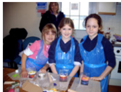
Splat cookery workshop