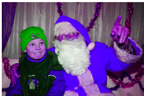
Santa visits Thomley